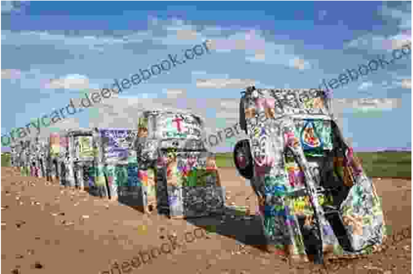
Cadillac Ranch, Amarillo, Texas