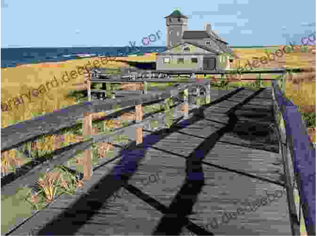
Cape Cod National Seashore Road, Massachusetts