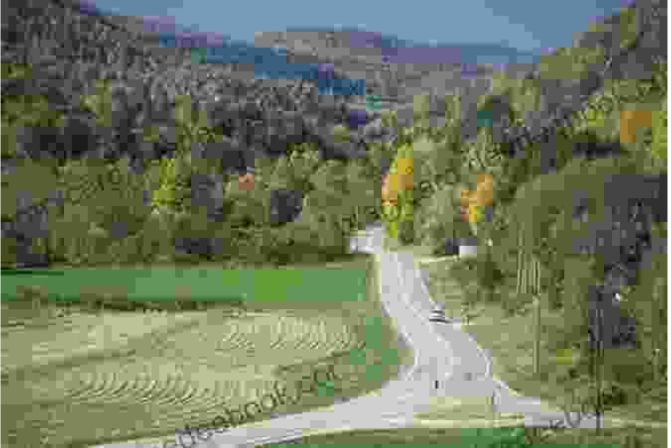
Vermont Route 100, Vermont