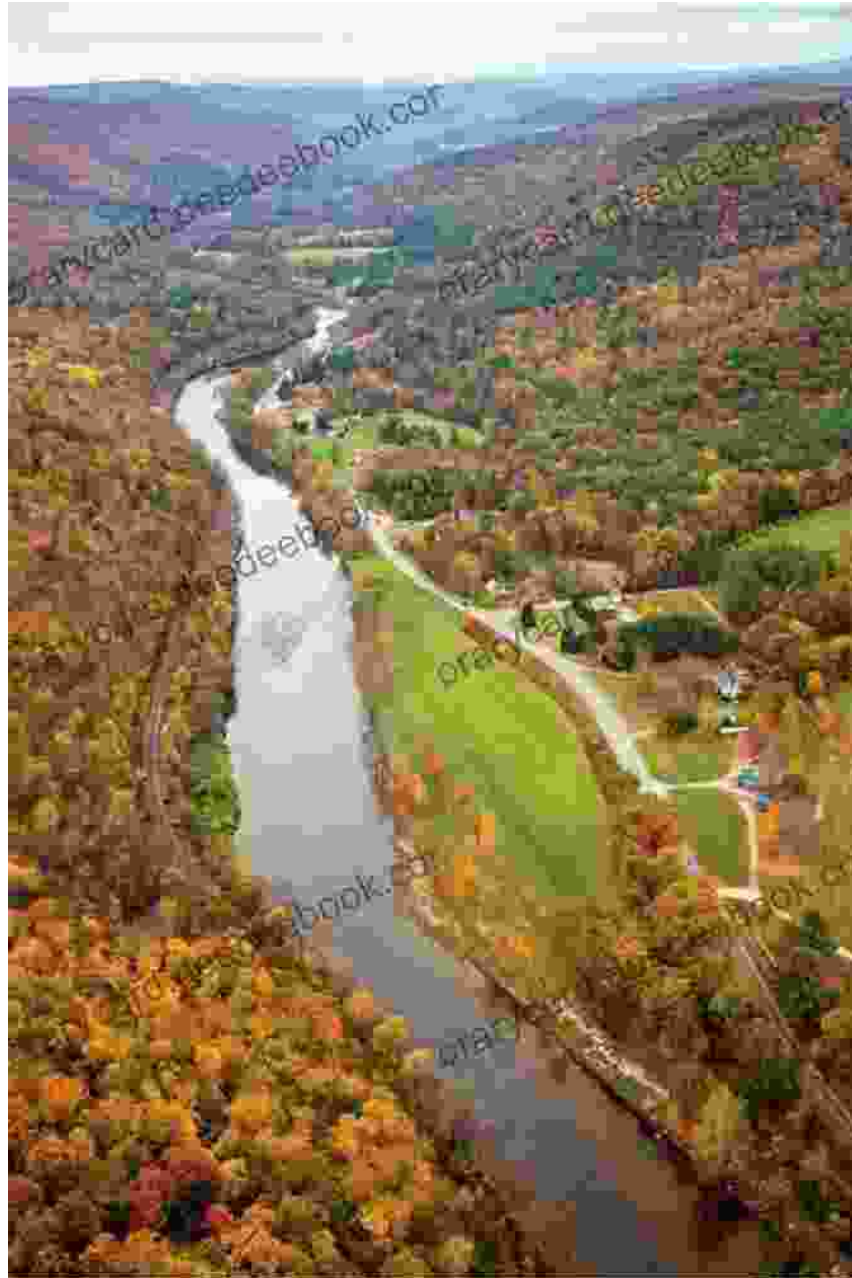
Mohawk Trail, Massachusetts