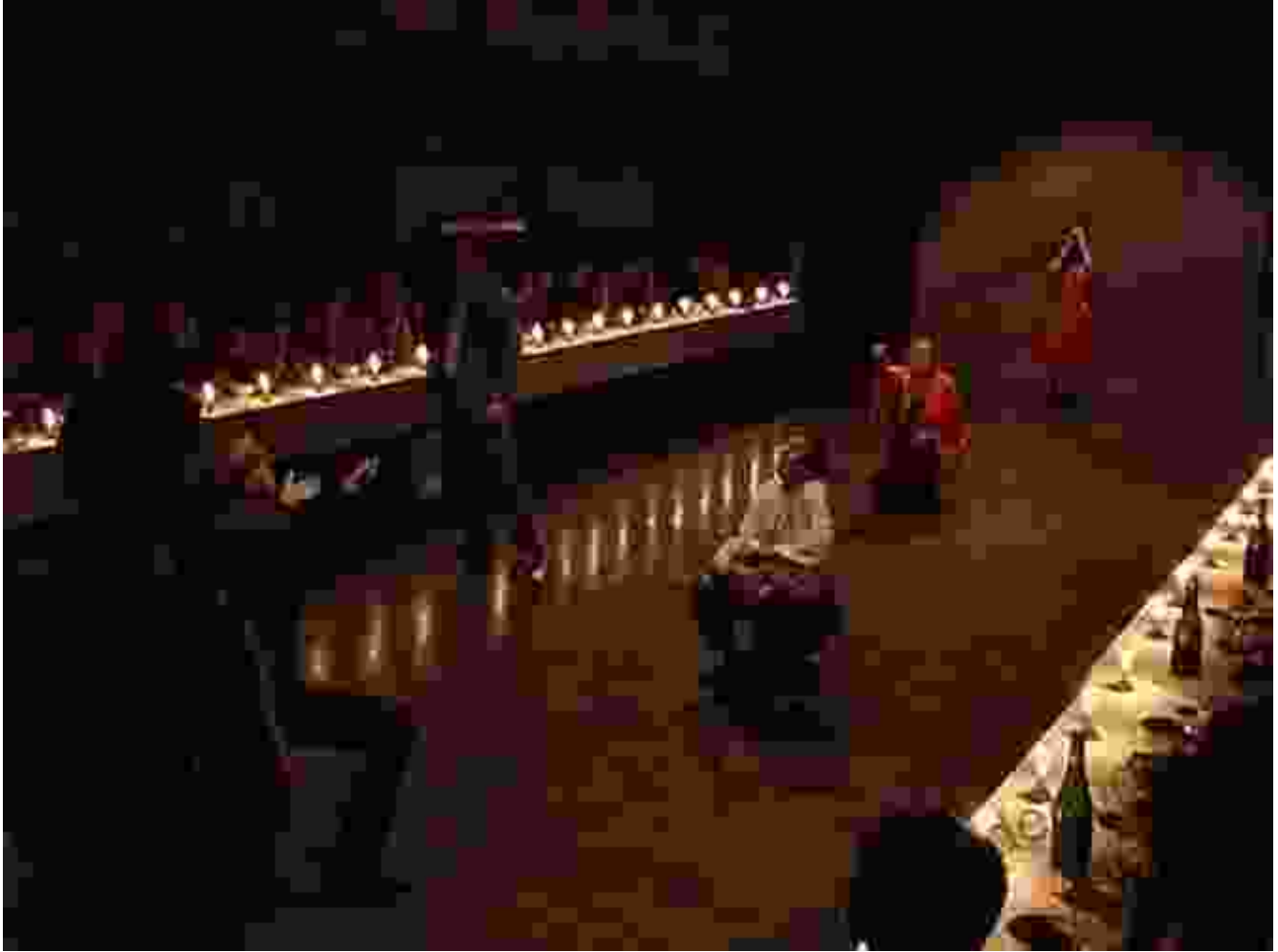
Odin Teatret actors performing on stage.