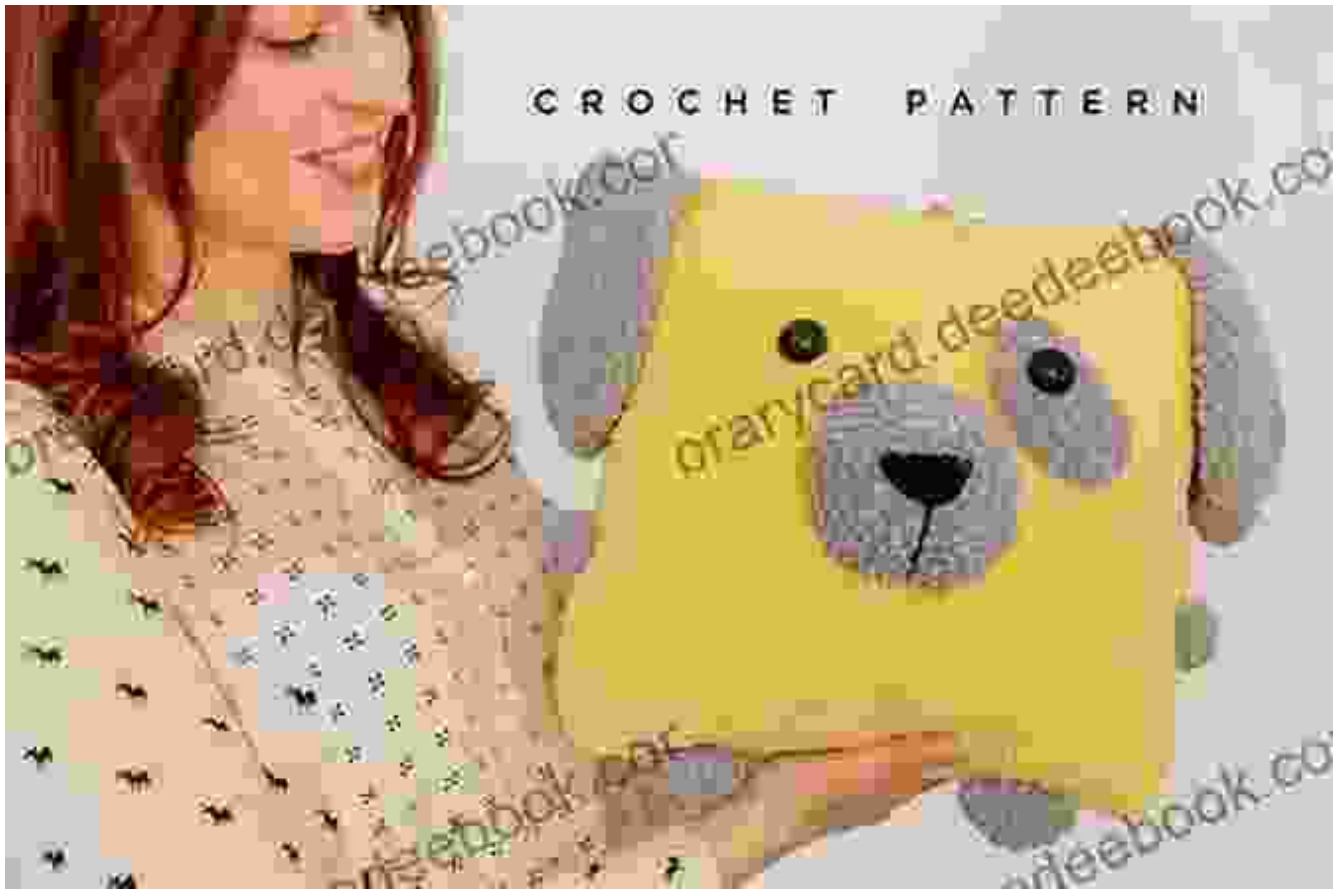
A crocheted Pillow Pal dog.