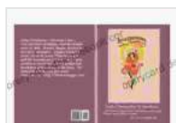
Image credits: [Image of Theresa Vaughn as Fifi Fricot] [Image of "The Belle of Broadway" playbill]

"The Belle of Broadway" not only showcased Theresa Vaughn's extraordinary talent but also left an indelible mark on the history of American theater. Its legacy of laughter and inspiration continues to enchant and entertain audiences to this day.